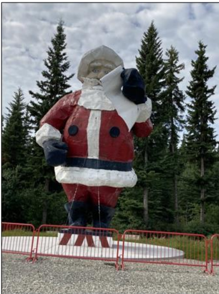
Figure 2. At North Pole

We bypassed Fairbanks and drove further north to see the famous Alaska Pipeline. The pipeline looked quite different now. I remembered it being clear of brush and trees near the pipe. Now it is thick brush everywhere and it is hard to see the pipe except at designated viewing areas. We then backtracked a ways and went east to North Pole. Within the town of North Pole is a very large building where you can buy Christmas presents all year. One attraction there is a service where you can deposit a note from Santa to your child. They will place the note in an envelope and send it to your child with a return address of "North Pole, Alaska."