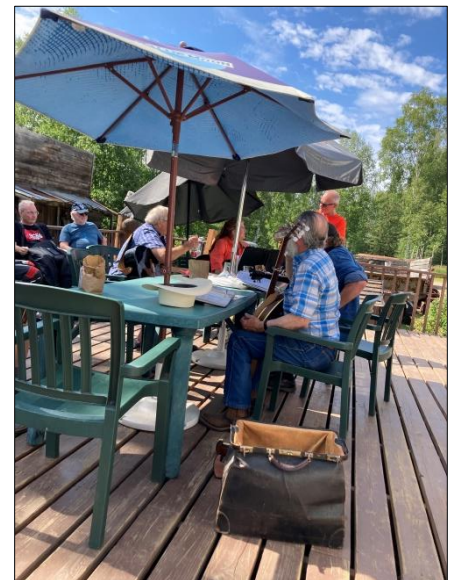
Figure 4. Fun on the Malemute Sun Deck