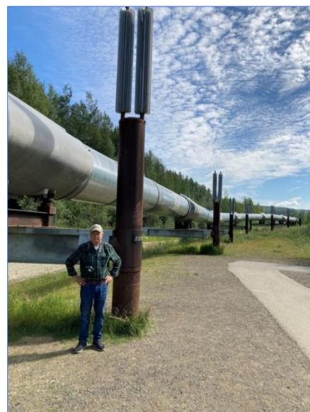
Figure 1. The Alaska Pipeline

had, it seems like yesterday. The road north from Denali was different from the heavily travelled highway south of Denali. There was only a fraction of the traffic and there were rest stops about every 15 to 20 miles. South of Denali, we didn't see a rest stop from Wasilla to Denali, a distance of 168 miles. However, one thing