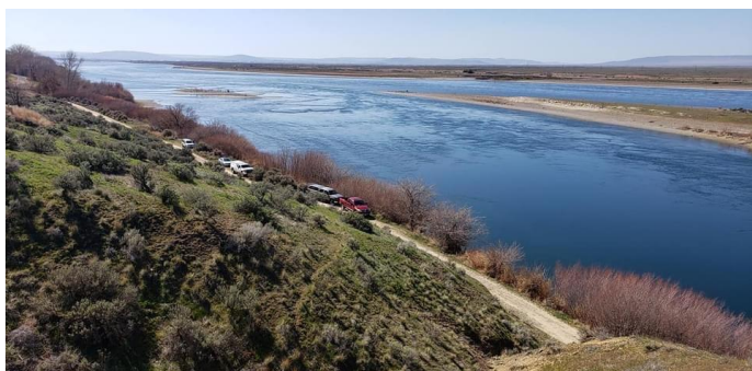
View from Top of Ridge

In the early afternoon, we decided to go get lunch and try some other places. We found an interesting little place that Greg was familiar with. It was a gas station in the middle of nowhere but had a great little take-out restaurant inside. They had really good Mexican food. We took our lunch and went to a State Park where we wanted to check out for agates. We found a nice table in a grassy area and ate our lunch. We walked around the park which had a very nice campground but was closed for camping. We did not find any interesting rocks, but it was a very pretty area next to the river.