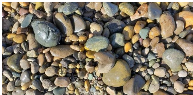
Samples of Other Rocks to Collect