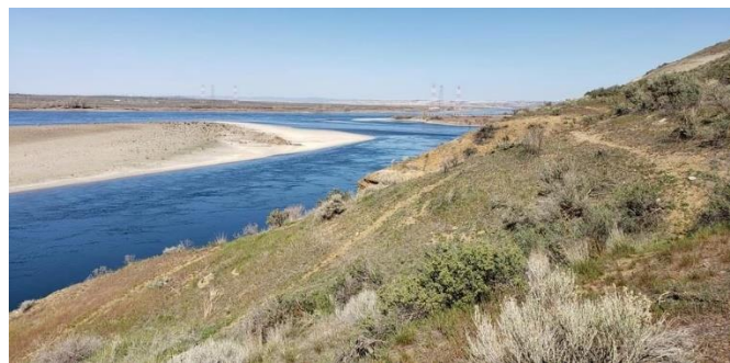
Another View from Top of Ridge

We went back to the hotel and examined our finds for the day. After having a late lunch, we decided to just snack and relax for the day. The hotel manager let us use a table in the dining room and we played games and had some great laughs.