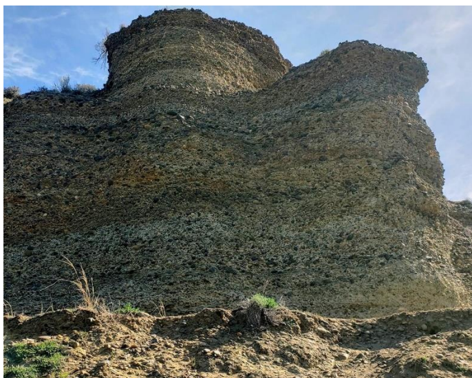
The Wall at Fir Road

In the early afternoon, we decided to go get lunch and try some other places. We found an interesting little place that Greg was familiar with. It was a gas station in the middle of nowhere but had a great little take-out restaurant inside. They had really good Mexican food. We took our lunch and went to a State Park where we wanted to check out for agates. We found a nice table in a grassy area and ate our lunch. We walked around the park which had a very nice campground but was closed for camping. We did not find any interesting rocks, but it was a very pretty area next to the river.