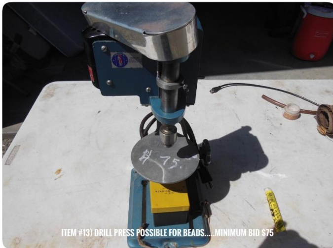
ITEM #13) DRILL PRESS POSSIBLE FOR BEADS.....MINIMUM BID $75