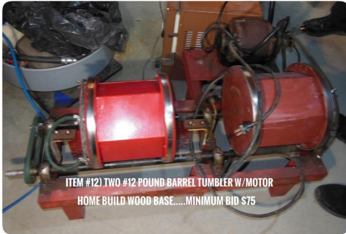
ITEM #12) TWO #12 POUND BARREL TUMBLER W/MOTOR HOME BUILD WOOD BASE.....MINIMUM BID $75