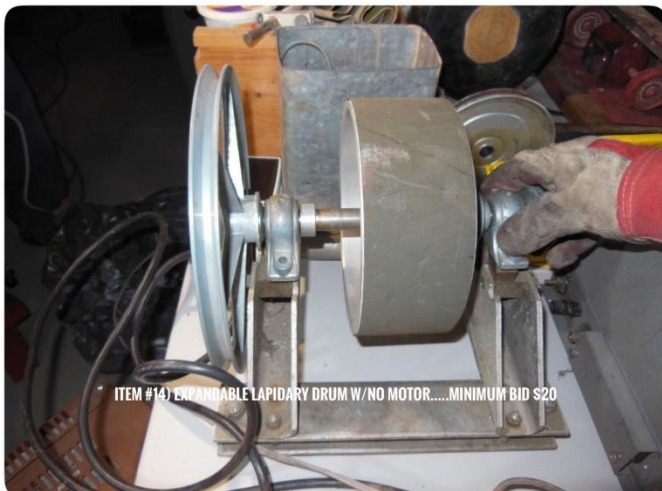
ITEM #14) EXPANDABLE LAPIDARY DRUM W/NO MOTOR.....MINIMUM BID $20