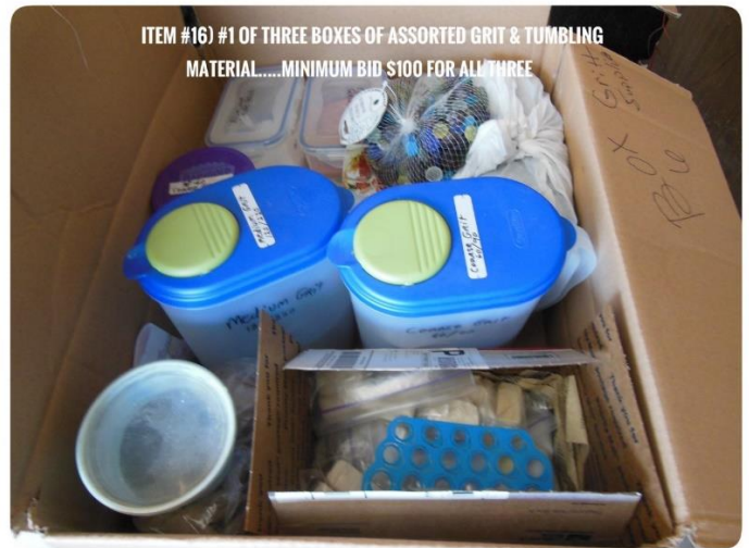
ITEM #16) #1 OF THREE BOXES OF ASSORTED GRIT & TUMBLING MATERIAL.....MINIMUM BID $100 FOR ALL THREE