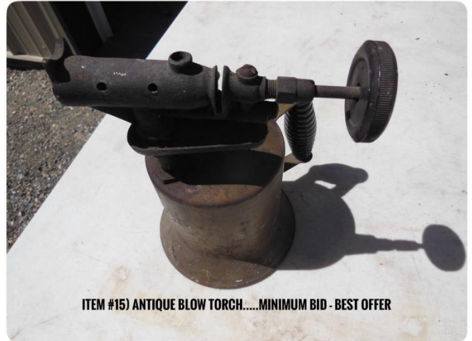
ITEM #15) ANTIQUE BLOW TORCH.....MINIMUM BID - BEST OFFER