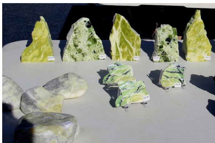
Some samples of Noble Serpentine from their mine