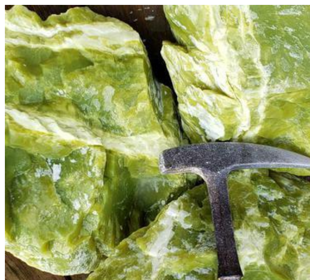
Photo of mixed grade rough