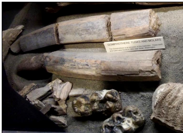
Tusks and Teeth of a Gomphothere Found Near Selah in 1963.

If you are in the Yakima area, the museum is well worth visiting. Their website is www.yakimavalleymuseum.org