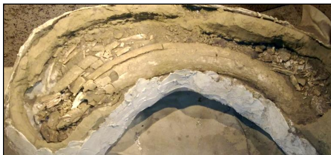
Mammoth Tusk Found in Moxee

The lower level of the museum has a nice section on northwest geologic history and a collection of minerals specimens and fossils found in the area. The mammoth tusk found in Moxee is on display (in its original plaster cast), as well as other fossils.