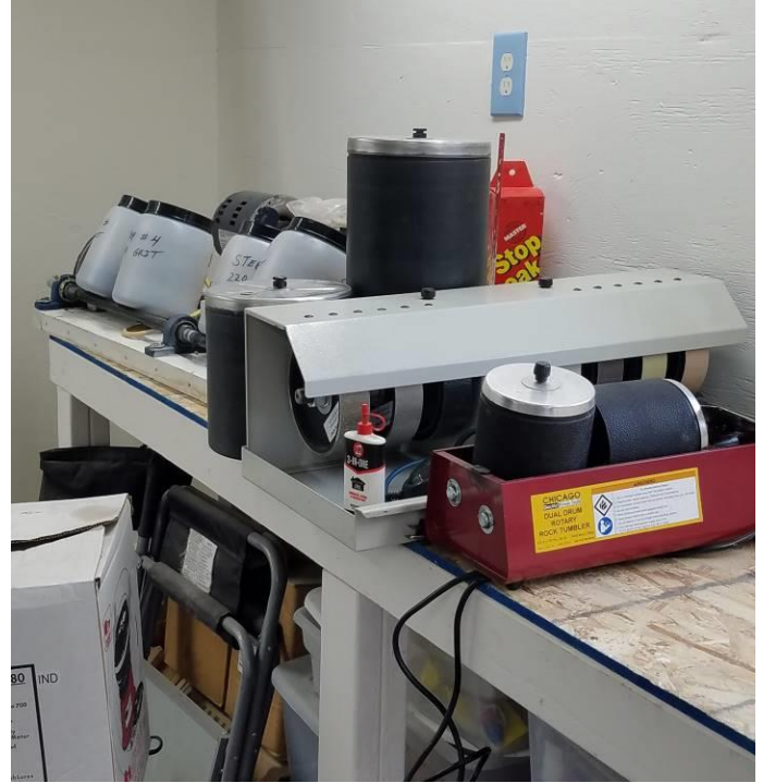
The other equipment and supplies were spread out to see how the work flow could best be laid out.