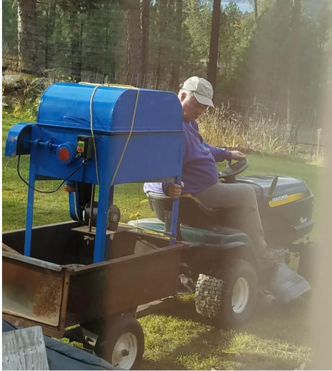
Finally, it was moving time. The equipment was moved out of the small 8' x 12' Tool Shed and into its new location.