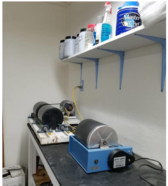
The 3 rock tumblers were installed on their own bench with a thick, noise-cushioning, bounce-reducing mat.