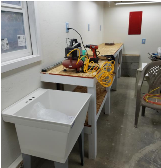
Benches were built for the different pieces of machinery, with a lower shelf supply storage. A new sink was installed to supply water for cleanup and rock equipment.