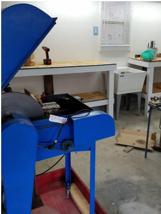
The slab saw was placed at one end of the shop to keep it out of the way of the work flow.