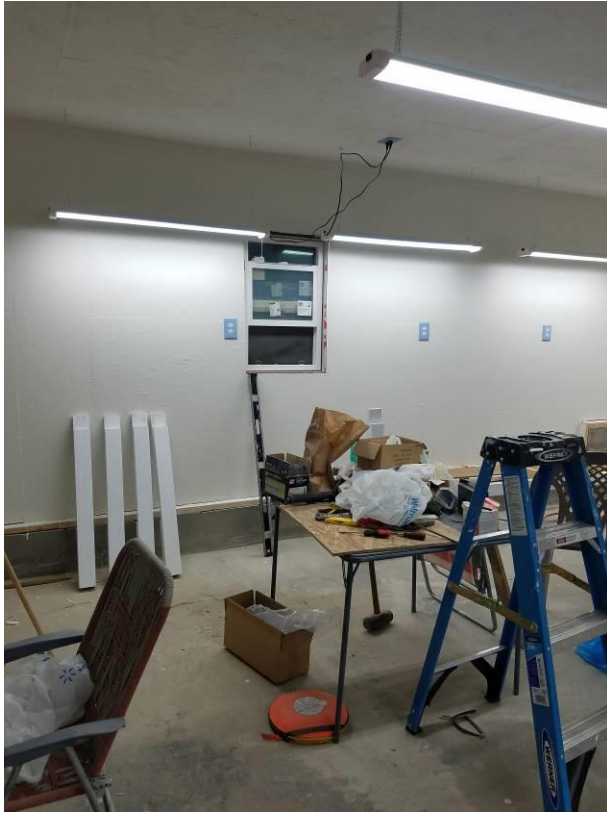
Next came new insulation, then new walls, and finally a coat of paint.