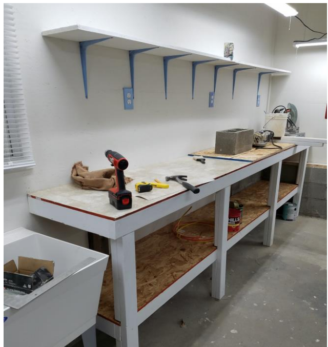
Linoleum was added to the top of the bench to help prevent water damage.