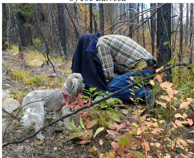
[Greg Van and Scruffy looking for Scheelite]