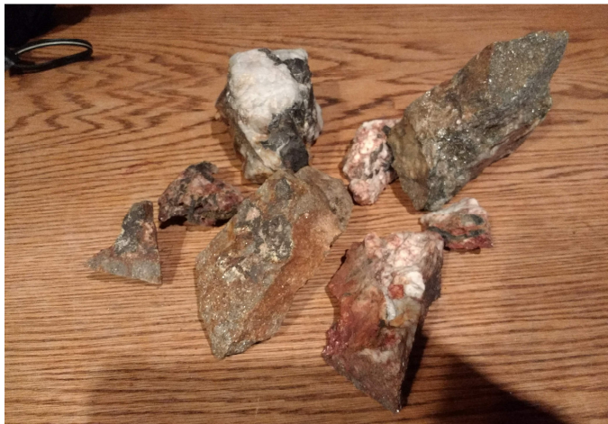
[The rocks we found in ordinary light]

There are articles about the Germania in this newsletter in 2005, 20013, 2014 and 2016. You can just go to the website, PanoramaGem.com and type "Germania" into the search box to find links to all of those articles.