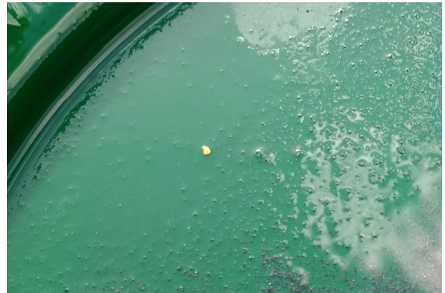
[This gold flake sits high and dry in the pan]