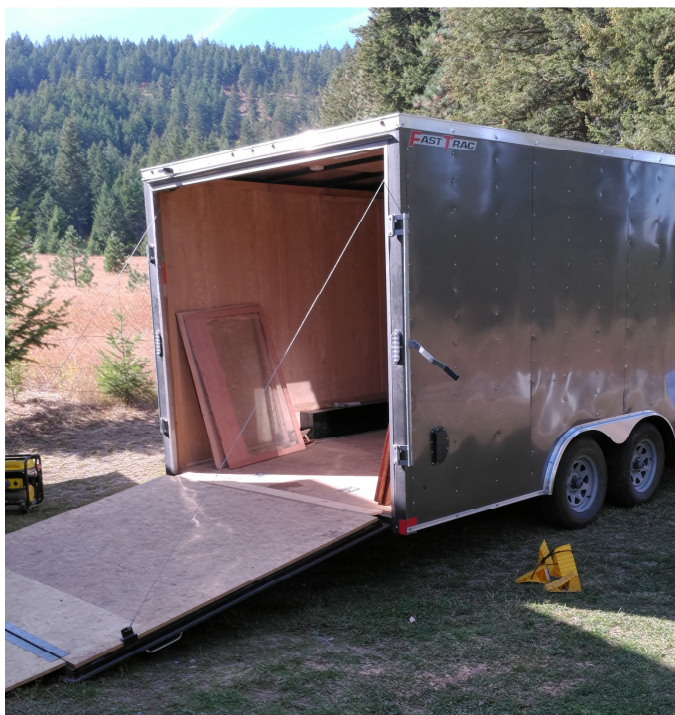
[A new trailer to hold our cases until the rock show]