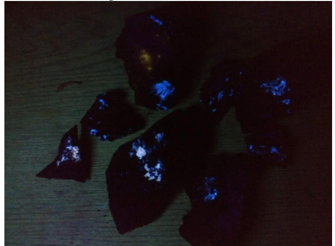
[Those same rocks under UV]

green, orange, red and yellow under UV light is more common. So if you are a dedicated collector of fluorescent rocks as is Greg, you want to find some samples of Scheelite.