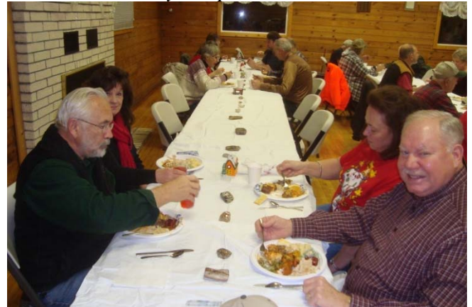
[The Annual Christmas Potluck and Gift Exchange]