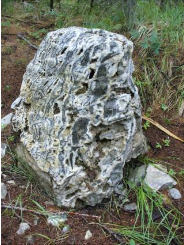
[This piece was riddled with vugs]

minerals is very good. His prices are really reasonable for the quality of his specimens. So the next time you go to Horseshoe Mountain and he is open, stop in. Oh, and bring more than $20.