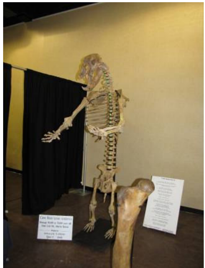
[Cave Bear from Siberia]