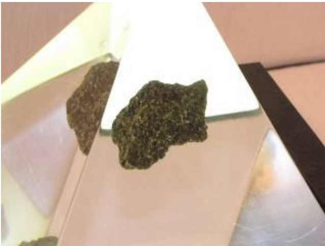
[This is either the moon rock or extremely over-rated leaverite]

Bev also recommends the following 2009 Rock and Gem Shows in WA., OR. , ID. & MT SUPPORT YOUR FELLOW ROCKHOUNDS AND ROCK CLUBS. Sept. 12-13 Marcus Whitman Gem and Mineral Society-Walla Walla Sept. 18-20 Portland Regional Gem and Mineral Show— Hillsboro Sept. 18-20 Far West Lapidary and Gem—Coos Bay Sept. 26-27 Hellgate Mineral Society— Missoula MT. CONSULT www.amfed.org/nfms FOR SHOW DETAILS