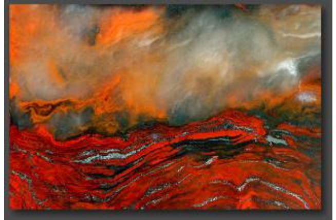
Hematite Jasper – Arizona