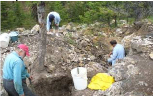
[The main dig at the Koepke crystal site] (The site found by Gary Koepke now deceased.)

It was time to plow through the thunder storms back to Kettle Falls. Notice I didn't mention the rain. That's because we barely got a sprinkle. The storms pounded the fishermen, but we had our normal rain-free great day. A great day that was topped off with an ice cream cone at Sandy's.