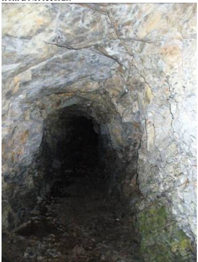
[The lower adit – either the Sunday or IOU mine.]

hardly any tailings in front of it. It does sit just above the old railroad bed and under the new railroad bed. The waste rock could have been used by the railroad. The second mystery is, that it is something like 600 feet below the upper adit. Is there a shaft from the top to the bottom? I show a mine named the I.O.U. at that spot from DNR records.