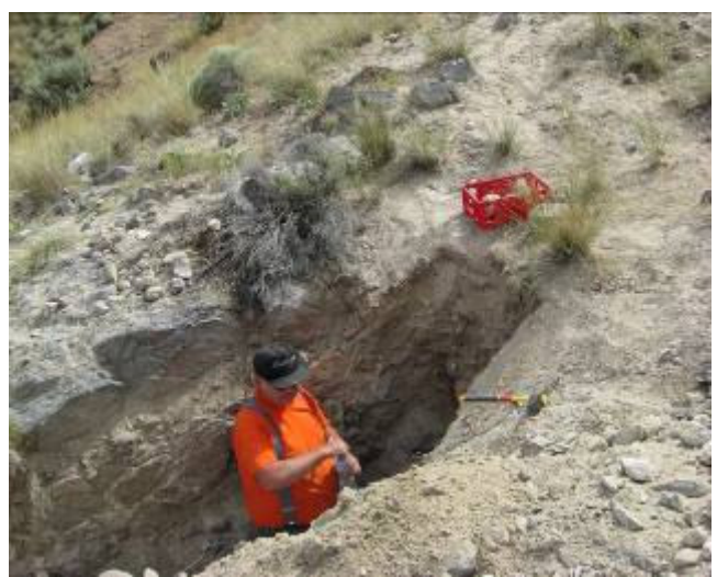
[ Succor Creek Canyon ]

Jasper in the morning. Ginger found a large chunk that was about 4 feet diameter and we spent a couple of hours reducing it to a size that we could handle. In the afternoon there was a leader who took us to what was close to the site called Hogg Canyon northeast of Weiser, Id, and it was an example of what happens when permission is not obtained, as we were confronted with an angry rancher. When we explained he became civil but the visit of the next group is very much in doubt. Some geodes and pieces of agate were collected, the wind got very strong so we gave up and headed back, that's when the rancher had the road blocked.