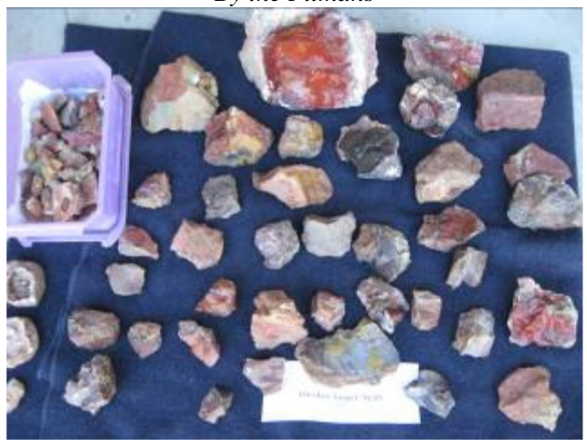
[Owyhee Jasper Agate]

June 20-22-2008 was the 68<sup>th</sup> Annual NFMS Show at Ontario, OR. The show was held at the fair grounds where the Pitmans, Roses and Bockmans camped. The show was a bit spread out but some of the dealers we see at our local shows were there and it was a good event.