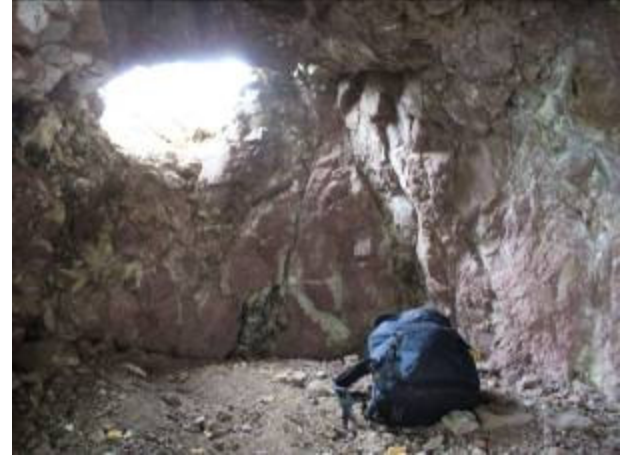
The jade-like rock was on the East side of the hill. It is so hard that we were barely able to bust off a few chards to bring back. Also – look out for burs that can stick all over your clothing. In short, a fun trip with good views and okay rocks.

Here is a map to the site. The terrain is steep and not really suitable for a club trip. There are outcrops of opal in several places around the mountain. Some are privately owned, but the access is through State land. The most-explored site is on the west side on a steep scree slope coming from an overhang (pretty much a cave) at the top. An opening on the north side of the cave leads to more exploration.