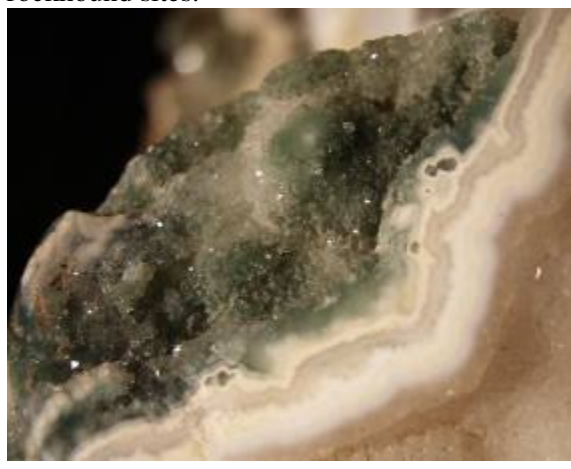
Agate-Jasper (not from Cere's Hill)

shattered like glass when I tried to take a small chip off one end. From then on, I then selected stones by shape. The agates were lumpy with round pits. The jasper and petrified wood were water-worn and had been in the gravel pile before it was cemented into conglomerate. The agates had formed later in holes dissolved out of the conglomerate. They took the shape of the cavity and the pits were where pebbles had protruded into the hole. This was a very good deposit, but I didn't get back for a couple of years. When I did, I found that the landowner, Weyerhaeuser, had erected a cyclone fence along both sides of the road with "No Trespassing" signs. At one time, Weyerhaeuser welcomed rockhounds, but a new executive had decided they couldn't afford to loose a few acres out of their millions, and tried to close all rockhound sites.