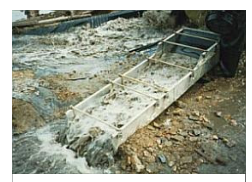
Mining placer box replicates the action of natural placer deposits.

because the disintegrated rock is carried away at a slower rate. There are many, many residual placers that have not beendiscovered because they are very difficult to find. The author has found several residual placers by going to similar-looking terrain near known deposits and simply digging an exploratory hole. A related type of placer is one in which the minerals are left on gravel bars.