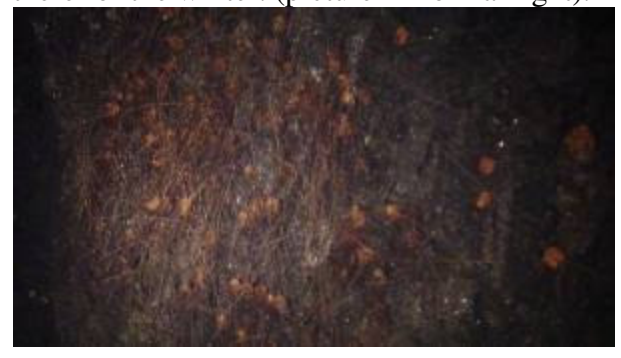
Spiders clustered on the mine walls.

We scanned the area with the UV light. The walls glowed light blue with a surface deposit. Also glowing with the same blue were the bodies of daddy long-leg spiders clustered there for the winter. (picture in normal light).