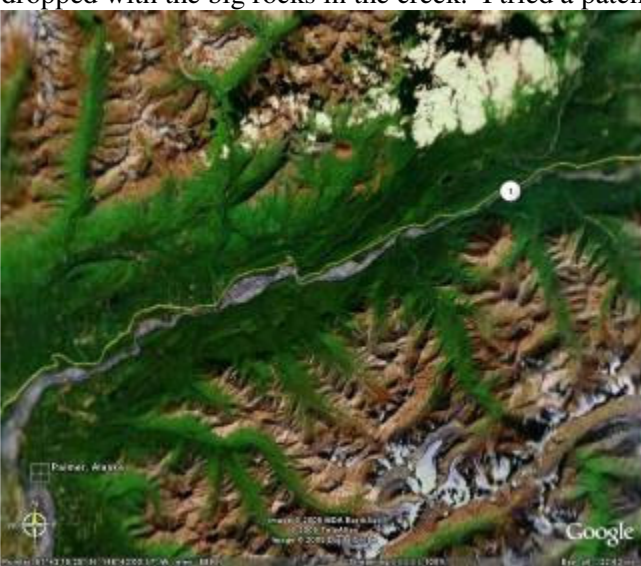
East of Palmer Alaska

gold was probably still being eroded out and would be dropped with the big rocks in the creek. I tried a patch