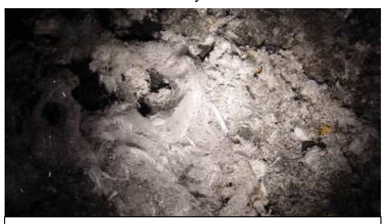
Cotton Candy fibers on a muck pile.

On the left side at the back was a slide of sparkling black clay with a crystalline fuzz growing out of it. It was too soft to move, pretty much like cotton candy.