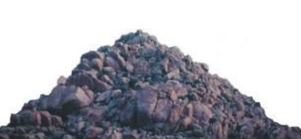
Figure 1. Weathered Granite Boulders