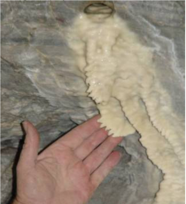
Another feature we took some time to check out was the amount of flow-stone that had accumulated as stalactites and stalagmites on some surfaces. No doubt, the large quantity of calcium in

It would have probably been even brighter if the jolt had not knocked loose two of the three bulbs in the UV lamp. (It's back together now with no harm done.) This pictures also shows shades of that elusive blue and more of the bright green. In fact we found large areas on some mine walls that fluoresced blue and green. Unfortunately, this turns out to be a surface phenomenon. The underlying rock does not fluoresce. So it's probably a growth or chemical reaction.