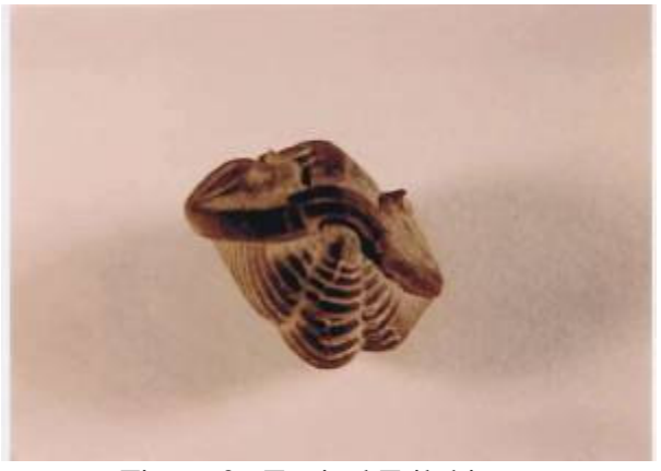
Figure 2. Typical Trilobite

The next trip to Dayton, I stayed far away from the Miami River dam. The weather was nice so I parked in the roadcut recommended by Les and walked up the side of the cut. The fossils were so thick that it was impossible to keep from stepping on some. There were brachiops, gastropods, cephalopods, bryozoans and coral fossils. Finally, under a bush I spotted my first trilobite. It was a nice flexicaliymene meeki , a variety that rolled up like a sowbug when disturbed (Figure 2). I went on to find eight more trilobites in the next two hours. When I got back to my office, Les was flabbergasted at all the trilobites I had found. He said it had taken him two years to find that many! He looked unhappy for a moment and then brightened up as he said, "Hey everybody, come see all the trilobites. I loaned Bob my trilobite whistle and look how great it worked!" Someone brought