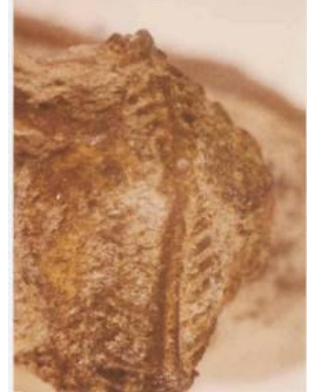
Figure 3. Mating Trilobites