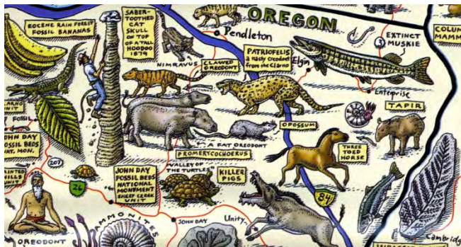
[A section of the poster that inspired the trip]

On top of that are the names and descriptions of the "formations" where these fossils are found, the scene on life on earth at the time, the connections that scientists made piecing together what is found from different times and places... It is a slice of the whole "paleo scene".