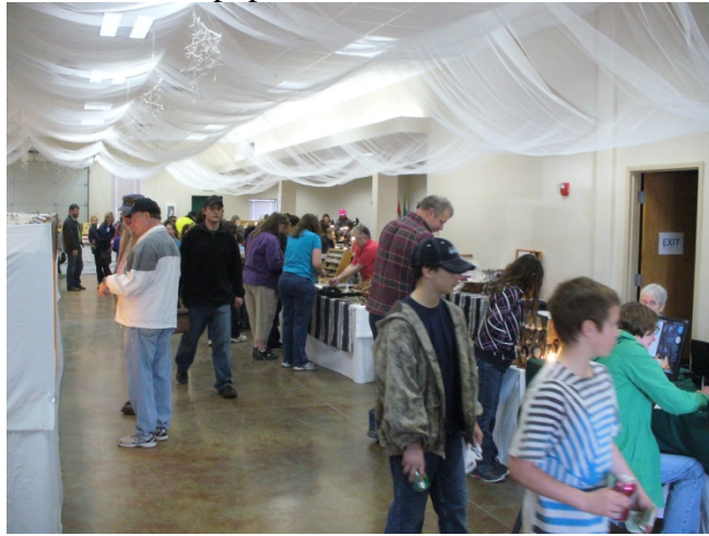
[A look down the right side of the main hall]

The food provided by the Spirit Summit 4-H Club was as popular as ever.