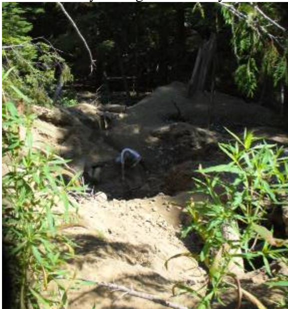
Unluckily, the old crystal dig looks like a war zone. Here is Nancy picking through the leftovers in one of the many many holes on the site. A well

Luckily, my friends Jim and Nancy had scheduled another whole day and were able to go back to the crystal dig the next day.