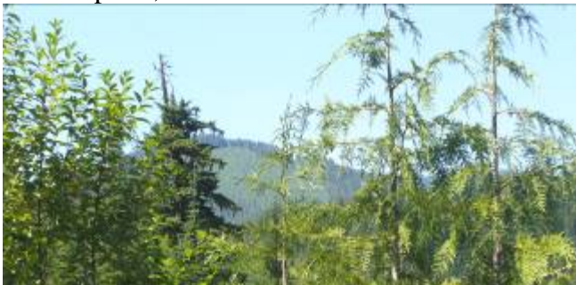
[Galena Point clearcut seen from Solo Creek]

While some folks are sitting back, polishing their rocks or going on effective field trips to well-known rock sites, others, myself in particular, are striking out into the unknown looking for that next big find and coming back with not much really except a long story to suck up space in the monthly rock club newsletter. There is always something to learn the hard way and we are out there making it as hard as possible. Case in point, Galena Point.