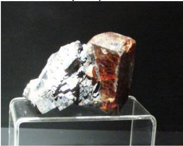
Rhodonite and Lead

Another interesting legacy of the region is that before there were railroads, travel over the hot dry outback was extremely difficult. Carrying the heavy minerals to riverboats for shipment around the world, called for extraordinary animals, and camels fit the bill. They brought in camels from Afghanistan. A